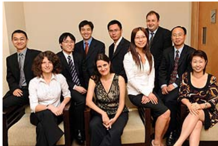
Ten scientists have each been given up to US$1.5 million (S$2.2 million) over three years to start their own research in Singapore, by the National Research Foundation (NRF).

TEN scientists aged 29 to 35, and of six different nationalities have each been given up to US$1.5 million (S$2.2 million) over three years to start their own research in Singapore, by the National Research Foundation (NRF). If they do good work, they can get another round of three-year funding.